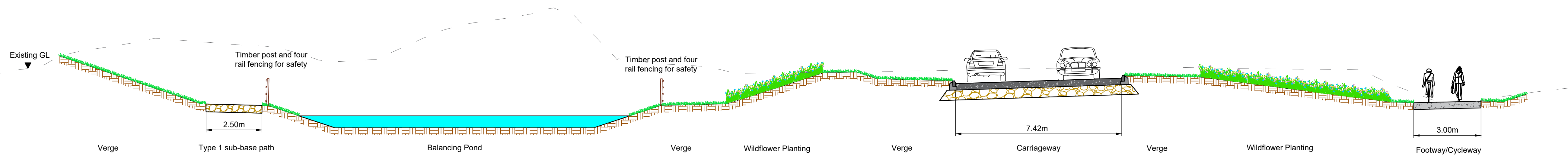
Section A - A (Chainage 500)

NOTE: Refer to drawing 60000032-WSP-ELS-NPAR-DR-LE-001 to see the location of these cross sections relative to the scheme